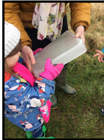
Looking at ice outside.