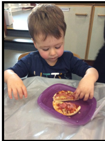
Making pizzas for tea.