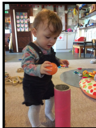
Having fun with the balls and tubes.