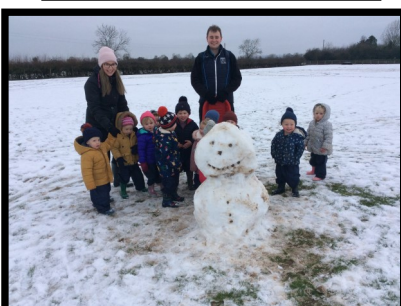
Our fantastic snowman.