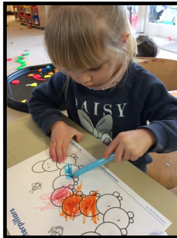
Caterpillar mark making.