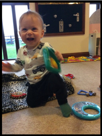
Having fun with music.