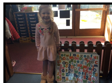
Recognising Letters and sounds.