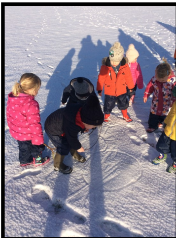
Mark making in the snow.