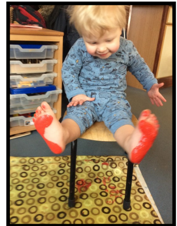
Feet painting for Valentines cards.