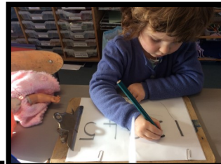
Tracing numbers one to five.