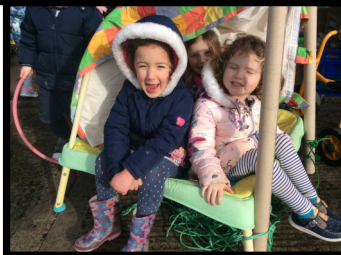
Making dens together.