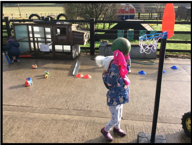
Anyone for Netball?