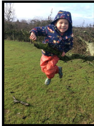
Having fun climbing high!