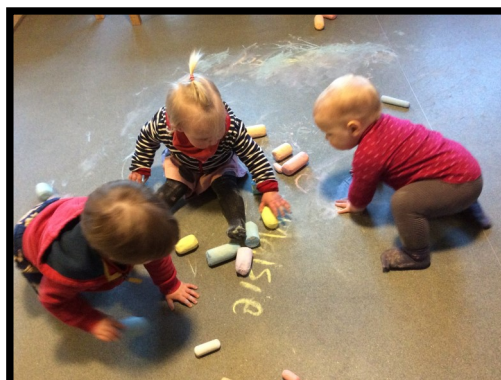
Exploring mark making.