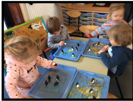
Exploring ice blocks and Penguins.