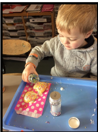
Making biscuits for Valentines Day. biscuits.