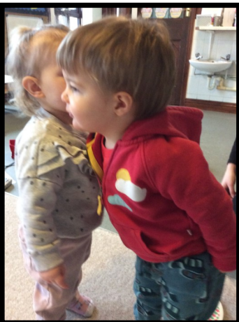
I've got something to tell you!