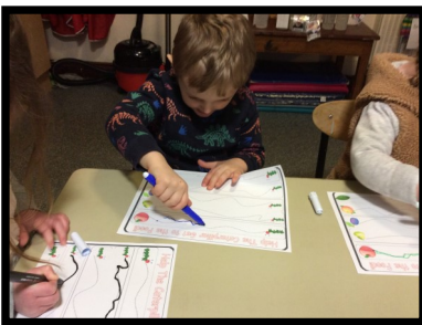
Pen control helping the Caterpillar find food.