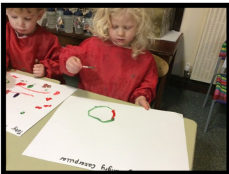
Painting a Caterpillar.