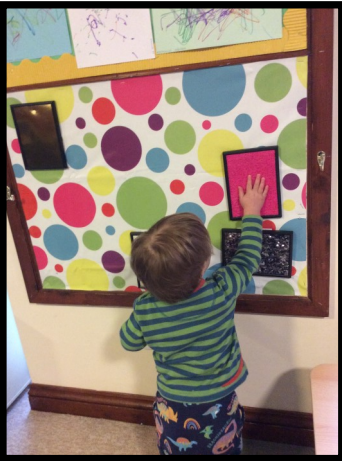
I wonder what that feels like.