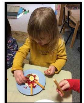
Rice Cake Caterpillar faces.