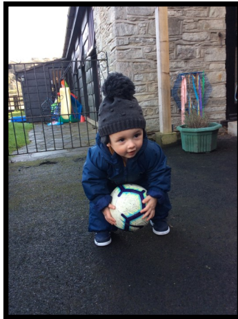
I caught it!