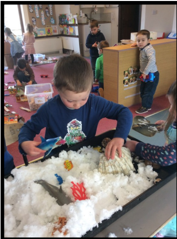
Enjoying some indoor snow play.