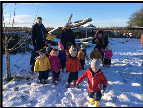
Fun in the snow.