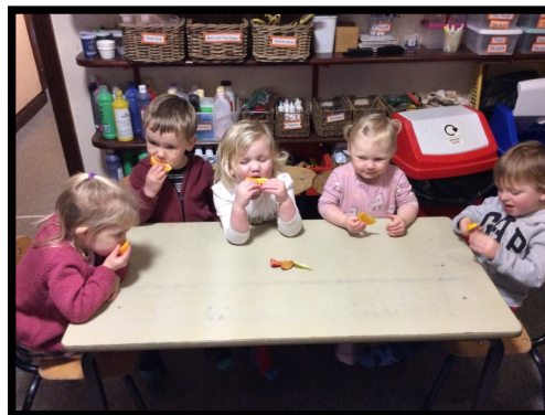
Food tasting, The very Hungry Caterpillar.