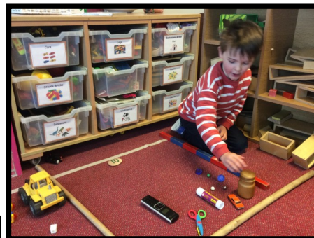
Making numeral and quantities.