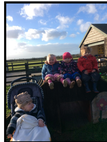
Look at us up here!