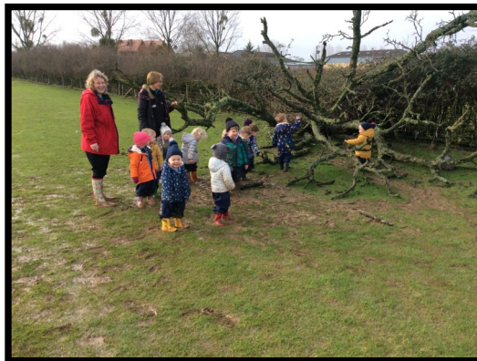
Our muddy walk in the big field.