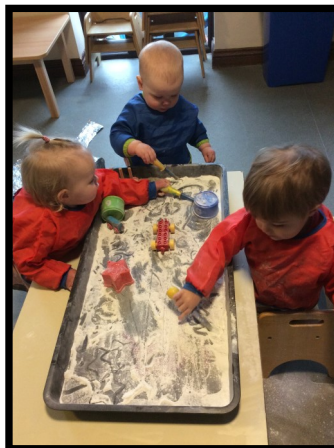
Exploring the flour.