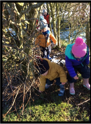
Collecting sticks from the meadow.