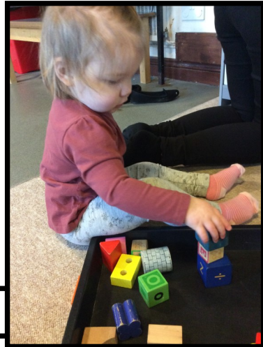
Showing good concentration building towers..