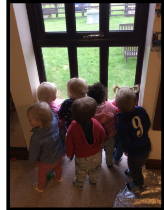
Come and look!