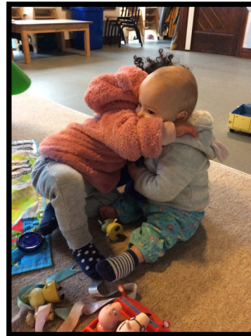
Nothing quite like a cuddle.