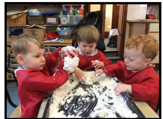
Playing with clean mud!