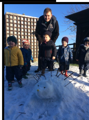
We made a snow Hedgehog!